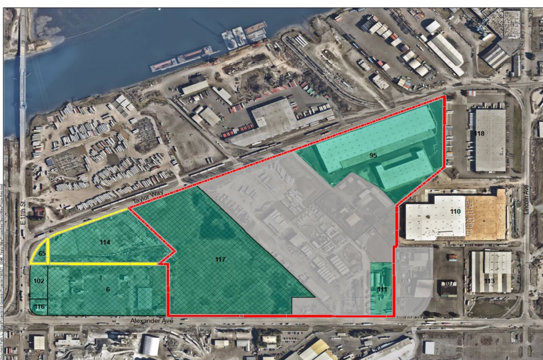
EXHIBIT A TAYLOR WAY PROPERTIES PORT OF TACOMA TACOMA, WA 98421 PORT PARCELS: 6, 65, 102, 114, 116, 117

SHEET: 1 OF 1 PURPOSE: INFORMATION DATE: 4/17/2019 AUTHOR: Brian Archer